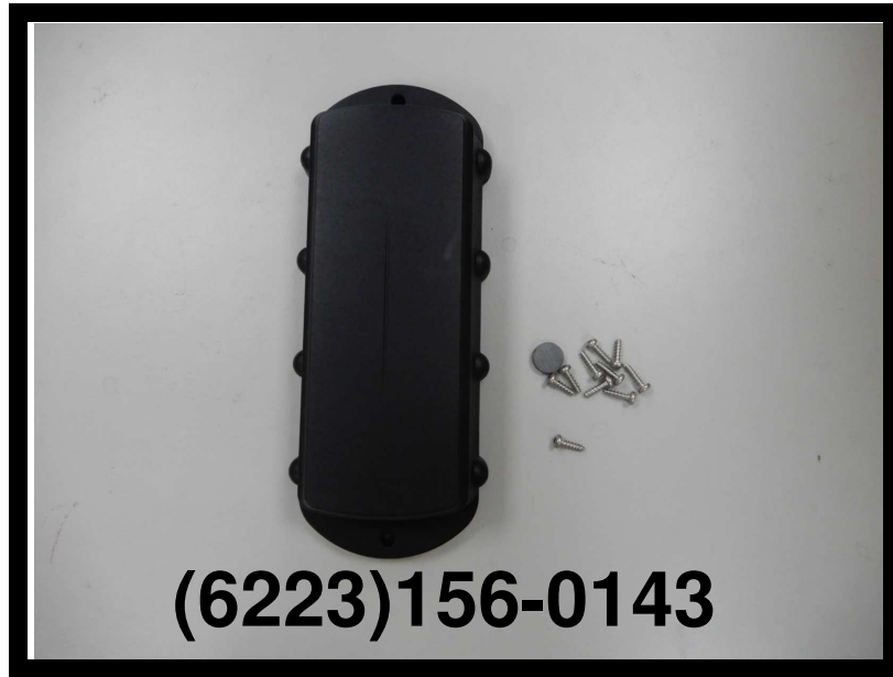
Photo of the Submitted Sample