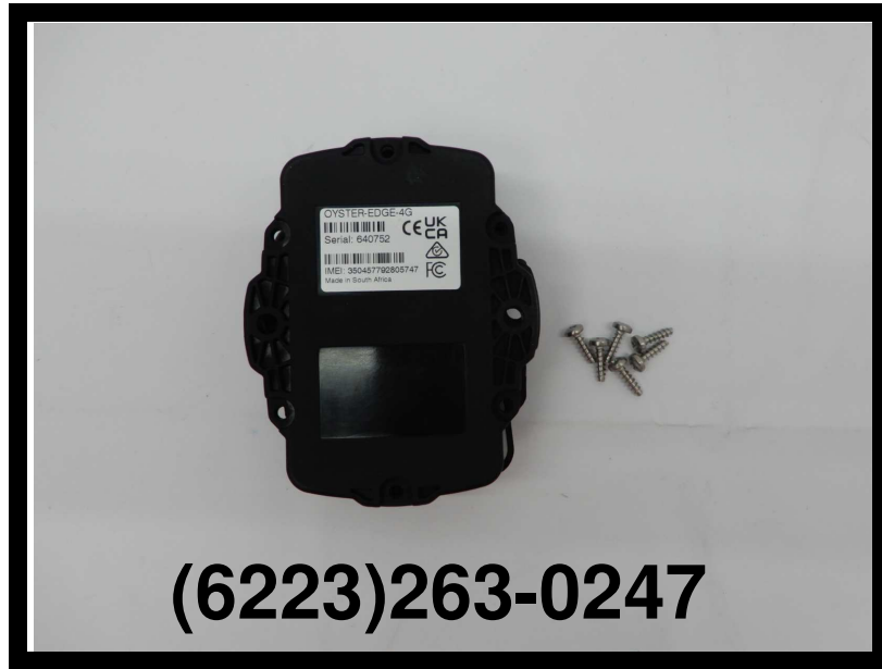
Photo of the Submitted Sample