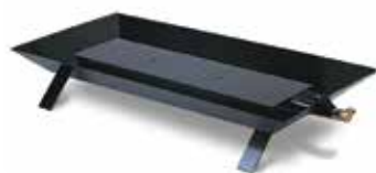
Vented CS Burner