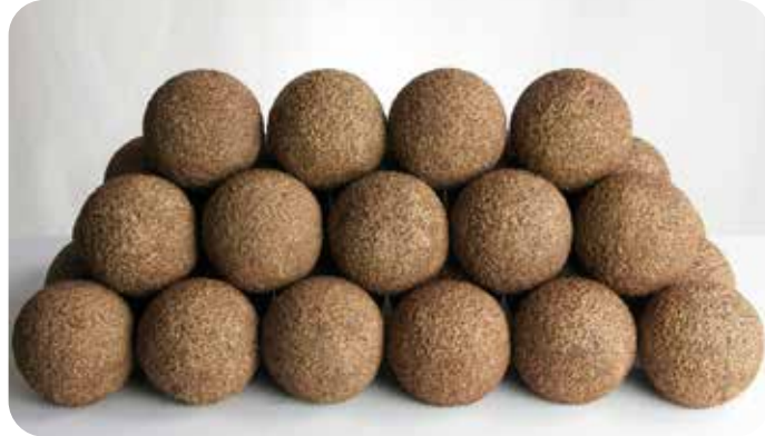
4” Rustic FireBalls in Rust Color

Individual FireBalls™ are available in 2”, 2.5”, 3”, 4”, 5”, 6”, 7”, 8” and 12” diameters, as well as 4”, 6” and 7” half-balls.