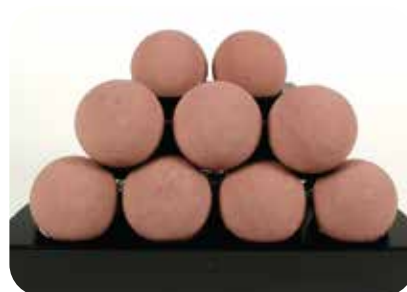
Adobe Red FireBalls on 20” Black Burner Chassis