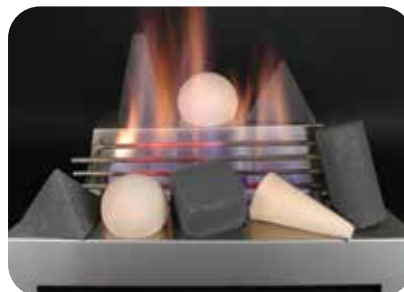
24" Black and Beige Fire- Shapes on Stainless Steel Burner Chassis