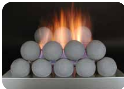
Dark Gray FireBalls on 24” Stainless Steel Burner Chassis