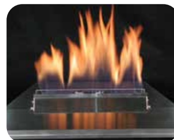
24" Stainless Steel Chassis