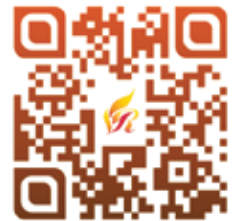
Vented FireShapes SCAN FOR MORE INFO