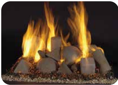
Small FireShapes in Natural Color On CXF Burner

Individual FireShapes™ include two sizes each of Cones, Cylinders, three and four-faced Pyramids and Cubes, as well as Spheres and Half-Spheres. Colors can be mixed and matched to complement décor.