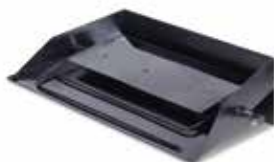
Vented CXF Burner

Vented CXF Burner Pans are tapered in shape and bring the flame to the hearth level. Features an adjustable rear leg to change the angle of display. For single sided fireplaces only.