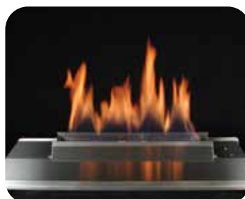
30" Double-Faced SS Chassis