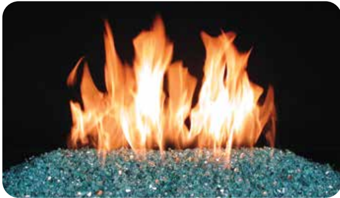
FireGlitter Burner with Blue-Green Glass