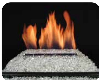
24" Black Chassis with Platinum Glass

The wedge-shaped chassis of the high-efficiency burner system and the firebox floor are covered with the special glass or beads to create an alluring presentation. For the minimalist, the chassis/burner alone may be used for a pure flame effect.