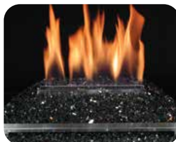
24" Stainless Steel Chassis with Black Glass