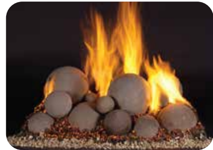
Mixed Size FireBalls in Natural Color on CXF Burner