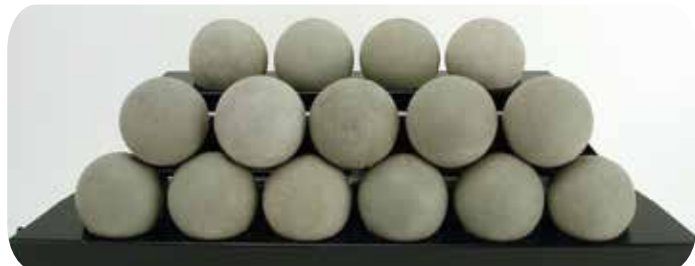
Natural FireBalls on 30” Black Burner Chassis

The flame of the See-Thru sets emanates from the middle of the four tiers (two on each side).