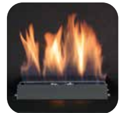
Vent-free 24” Black Chassis

STAINLESS STEEL FINISH CHASSIS - Provides a contrast to a darkened fireplace in which the chassis becomes a design element that complements the objects and the flame, giving a more contemporary appearance.