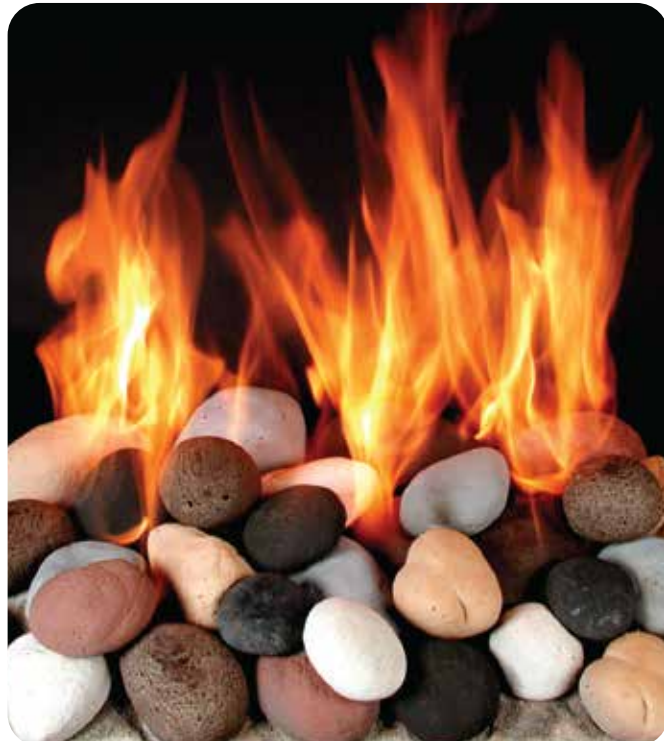
Calico FireStones on 24" CXF Burner