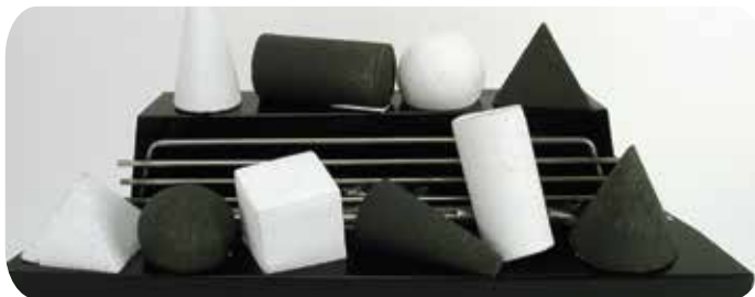
30" Black and White FireShapes on Black Burner Chassis

Single-sided sets have two tiers of FireShapes™ to create an orderly randomness of points, slants and arcs.