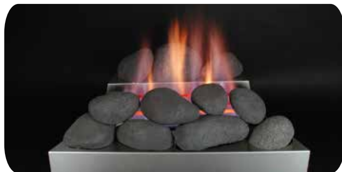
Black FireStones on 24" Stainless Burner Chassis

Single sided sets have three rows of FireStones™ while See-Through sets have two on each side. Single color and color combinations are available to beautifully complement the fireplace and room design.