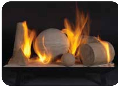
Mixed FireShapes in Natural Color On CS Burner