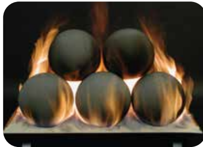
Black 8” FireBalls on CS Burner