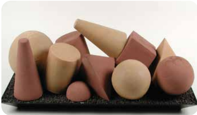
Large FireShapes in Beige and Adobe Red Colors On CS Burner

A variety of geometric shapes create an interesting display of angles and curves for the ultimate contemporary fireplace.