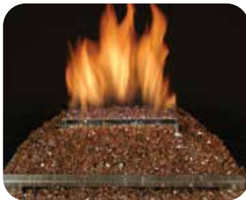
20" SS Chassis with Copper Glass