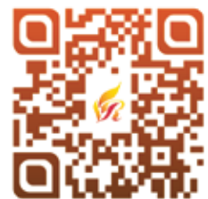
Vent-Free FireShapes SCAN FOR MORE INFO