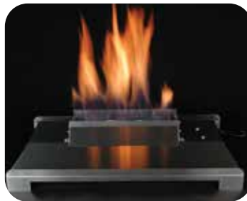
20" Double-Faced SS Chassis