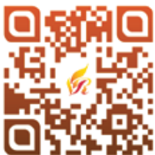
Vent-Free FireBalls SCAN FOR MORE INFO