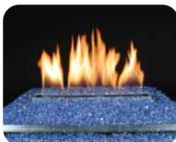
30" Stainless Steel Chassis with Cobalt Glass