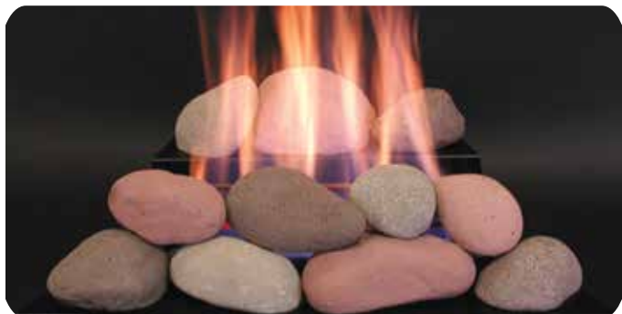
Brown, Natural and Adobe Red FireStones On 24" Black Burner Chassis