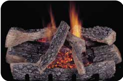
C5 Triple Burner