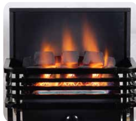
C9 With “Moderne” Basket