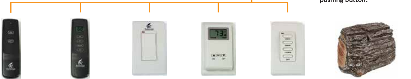
ON/OFF Remote (SR-2R)

Light burner and adjust flame height by pushing button.