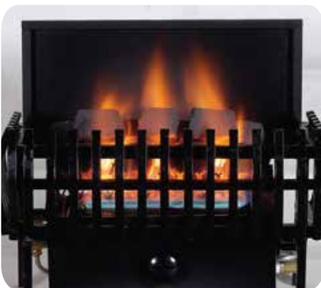
C9 With “Classic” Basket