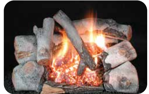
C8 Dual Burner

Birch style log set. Bark style shown on front.