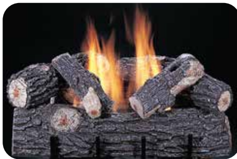
C1 Single Burner

Birch style log set. Bark style shown on front.