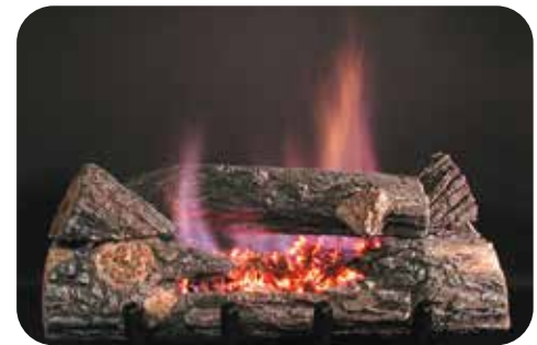
DFC7 Single Burner

Chillbuster CoalFire™ lets you enjoy the traditional look of a coal burning fireplace without the mess, smell or cost. Coal chunks are cast and colored just like our logs for years of trouble-free use. Available in 15” and 19” sizes to fit small Victorian and coal fireplaces.