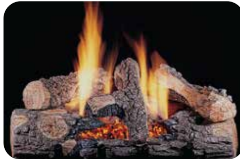
C7 Single Burner