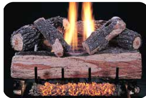
C2 Dual Burner