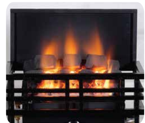
C9 With “Americana” Basket

C9 CoalFire™ with coals is also available separately for use with the basket of your choice