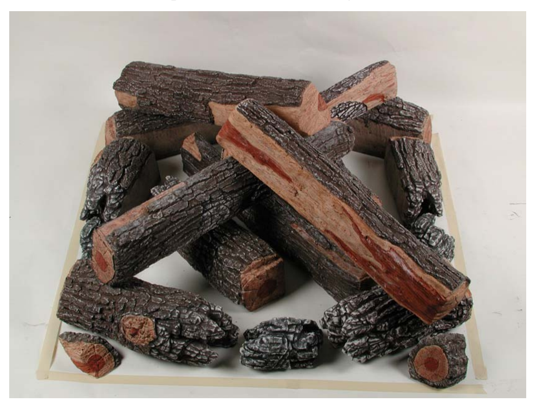
Here and on next page, fill in gaps with smaller top logs.

Place larger top logs as shown, supporting them on top of second-tier cross logs.