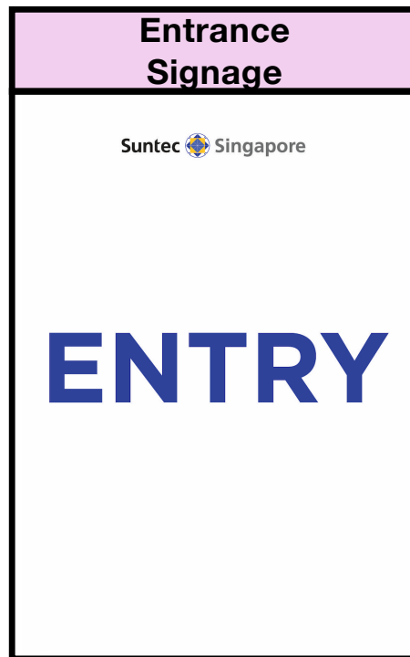
A3 Stand on Clipped on Queue Pole: To be placed on the queue pole at the start of each LUXEbuffettes line

> Each LUXEbuffettes will have the following signage displayed: