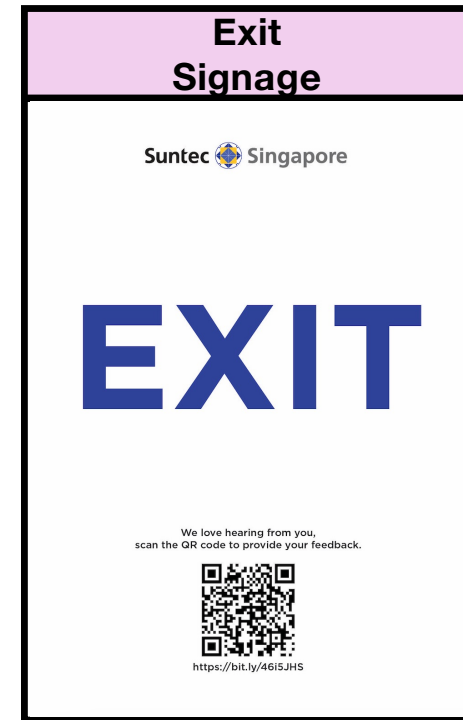
A3 Stand on Clipped on Queue Pole: To be placed on the queue pole at the start of each LUXEbuffettes line