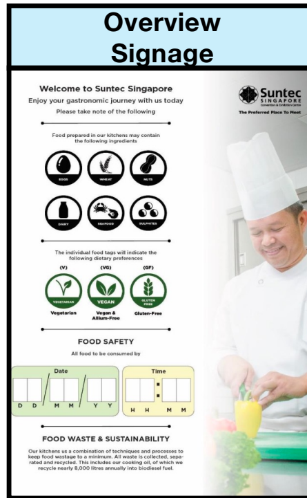
A4 Acrylic Stand: To be placed at the start of each LUXEbuffettes line